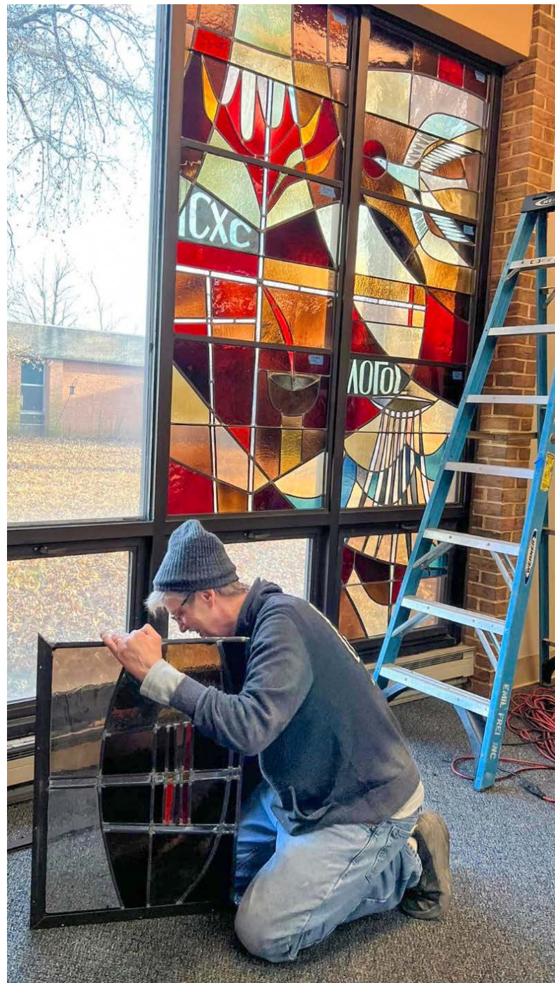
A craftsman from the Emil Frei Company removes the stained glass windows from the province center chapel.