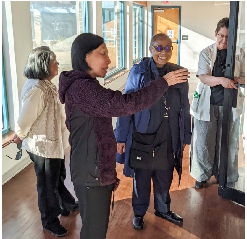
The Mid-North America Province Leadership Team tours the new space during a recent visit to St. Louis.