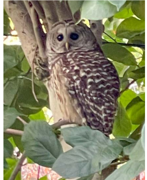
You never know who you’ll meet while walking to church. This is a barred owl sitting in a neighbor’s tree watching the Sunday morning foot traffic.

If this “revelation” speaks to you, we are ready to share. We hope you’ll want to start a Humble Green Planet “cell group” too within our Good Shepherd family. Contact us: joancspiering@gmail.com or lschille@gspmna.org .